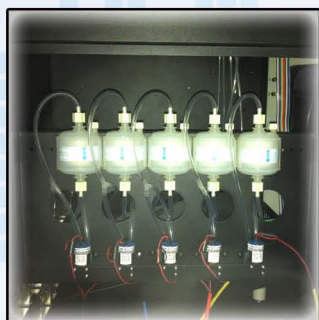
Ink supply system with cobetter® filter