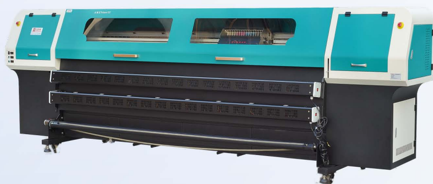
SPECTRA Polaris Print Head 35pl