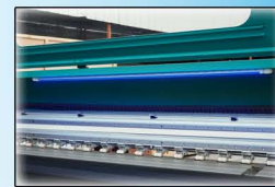
Dual silent linear guide and LED light