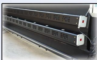
Dual thermal drying fans